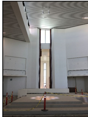
La luz de las ventanas brilla sobre el piso del Santuario