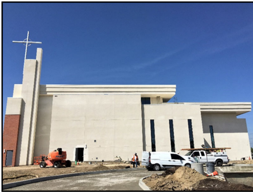
Vista de la Iglesia y la Capilla del Santísimo Sacramento al entrar desde el nuevo estacionamiento de Jaguar Way.