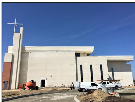
View of the Church and Blessed Sacrament Chapel when entering from the new parking lot off Jaguar Way.

THANK YOU to the 649 families that have made a pledge to the Capital Campaign to help build this beautiful Church and Parish Center for Christ Our Savior . Will you join us?