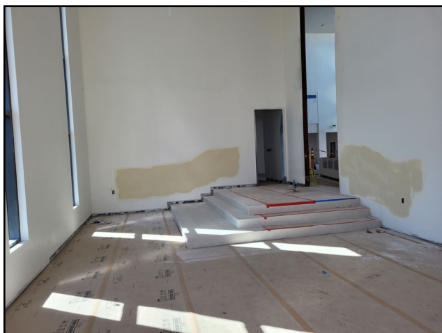
Blessed Sacrament Chapel