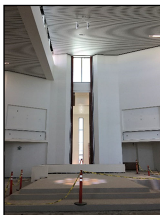
Light from windows shine down on the Sanctuary floor.