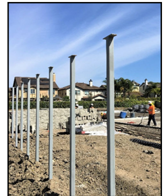
Las paredes de bloques separarán el espacio de reunión del estacionamiento