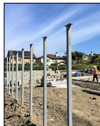
Wooden fence will separate the Gathering Space from parking.