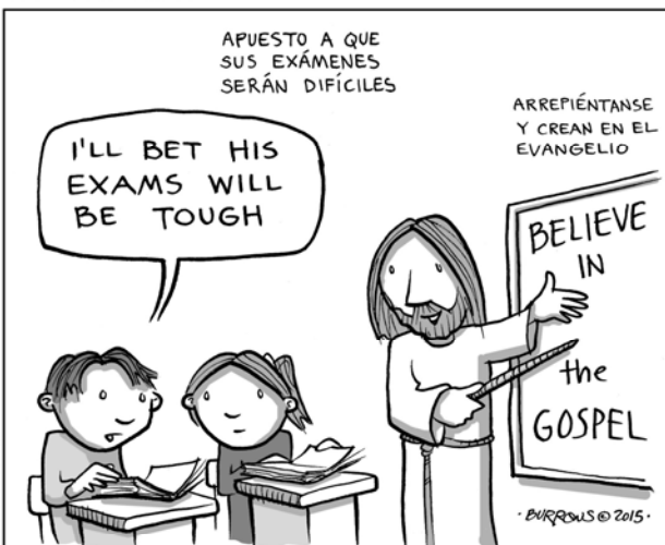
Then they came to Capernaum, and on the sabbath Jesus entered the synagogue and taught. The people were astonished at his teaching, for he taught them as one having authority and not as the scribes. Mt 1:21-22