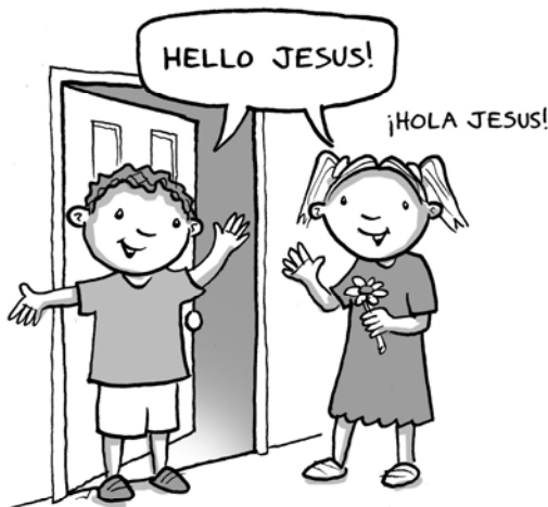
The Little Ones

Taking a child, Jesus placed it in their midst, and putting his arms around it, he said to them, “Whoever receives one child such as this in my name, receives me; and whoever receives me, receives not me but the One who sent me.” Mk 9:36-37